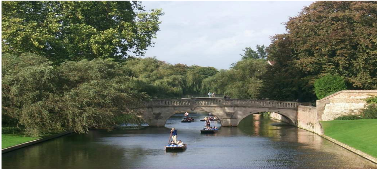
River Cam along Cambridge's College